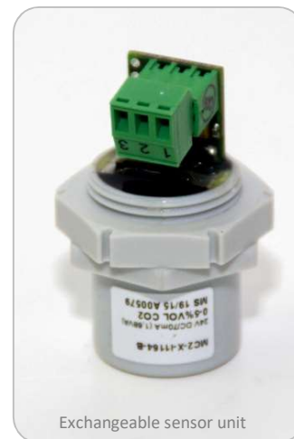
Exchangeable sensor unit