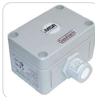
Standard Housing "D"