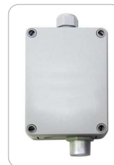
Option Housing "A"